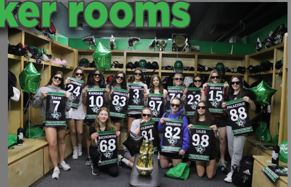
Dedicated Girls Locker rooms