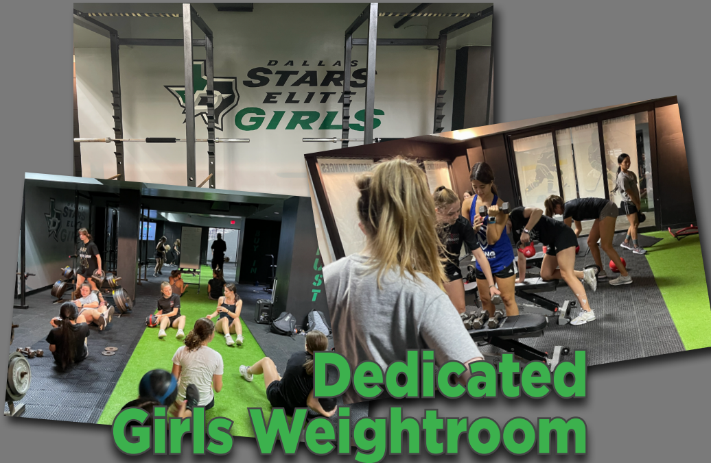
Dedicated Girls Weightroom