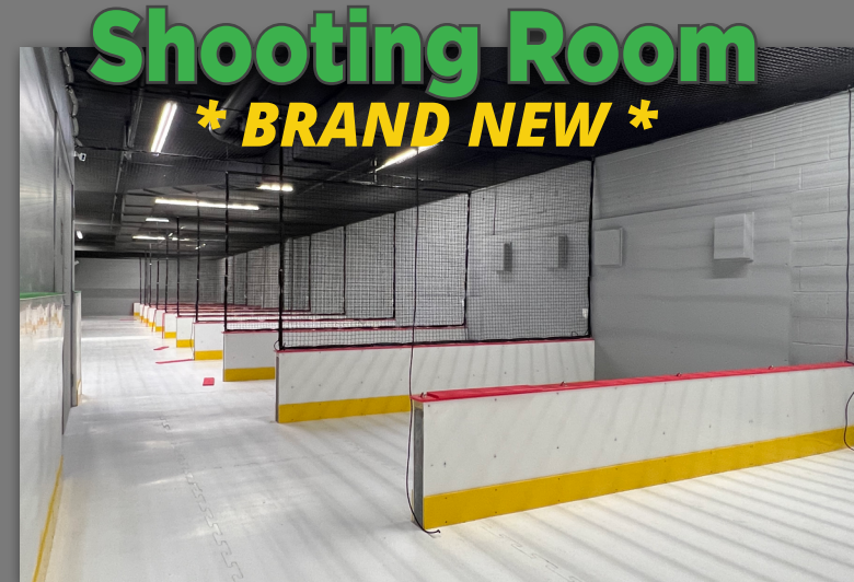
Shooting Room * BRAND NEW *